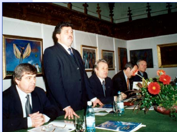
UGIR-903 National Council Iasi, 2003