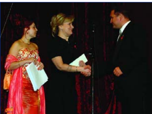
Industrialists Concert - Civic Romania Bucharest National Opera, 27 January 2005

The involvement of Romania's business sector in issues around HIV and AIDS is timely, now when the epidemic is at a low level. I would like to encourage the UGIR-1903 Confederation to continue its efforts to keep levels low. UNAIDS , through its Secretariat in Geneva and its office in Bucharest, will gladly assist these efforts and help the business sector to continue and diversify its involvement in the fights against HIV and AIDS.