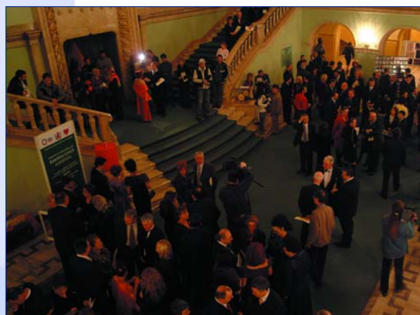
Industrialists Concert - Civic Romania Bucharest National Opera, 27 January 2005