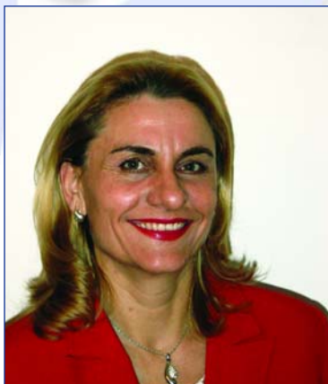
Maria GRAPINI Prime-Vicepresident of UGIR-1903 President of FEPAIUS