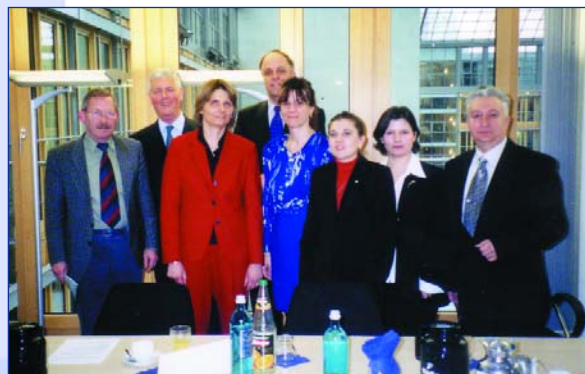
Romanian Delegation at BDA Germany