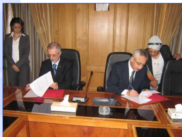
Signing the Cooperation Agreements between UGIR-1903 and Federation of Egyptian Industries - FEI