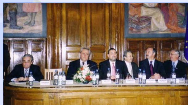
Forum of Employers Organizations Presidents 26 October 2004