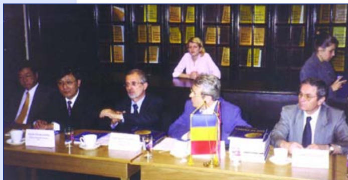
Signing the Cooperation Agreements between UGIR-1903 and Federation of Korean Industries - FKI